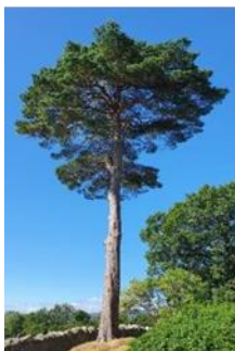
REACH FOR THE SKY