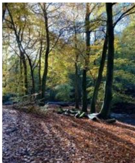
A SHAFT OF LIGHT