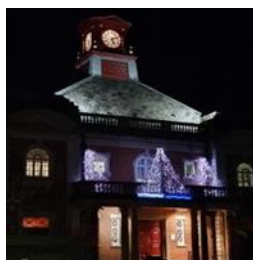
STIWT BEFORE CHRISTMAS